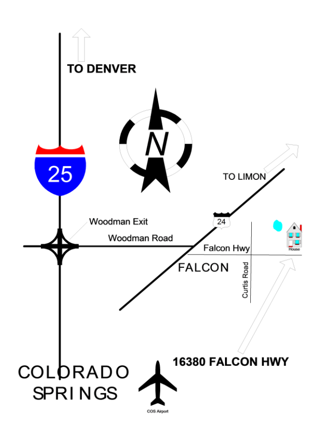
From I-25 North or South: Take Woodmen Road Exit and travel east to Highway 24. Turn Right on Highway 24 and then turn Left on Meridian. Go to stop sign and then Turn Left on Falcon Highway. Turn Left in driveway at 16380 Falcon Highway.